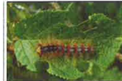
Gypsy moth larva (caterpillar)

View DATCP Slow the Spread spray progress