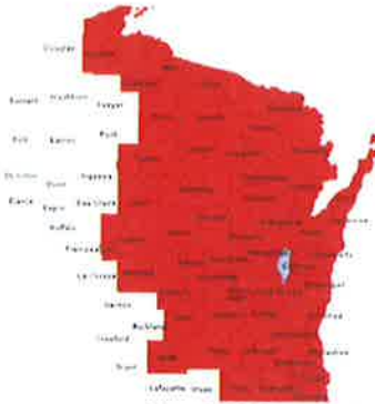
Don't Move Gypsy Moth – DATCP Quarantine Details

Click on a red county for contact info to report gypsy moths